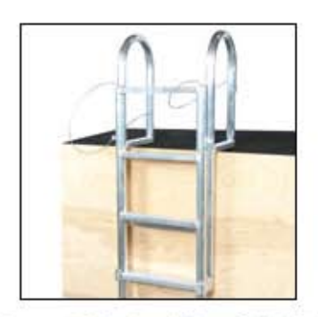
5 Step Lift Ladder (#A014) Attaches to existing fixed structure for easy access to your Jet Dock