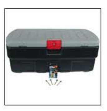
Dock Box (#A002) 48 gallon capacity dock box attaches to your Jet Dock for convenient storage