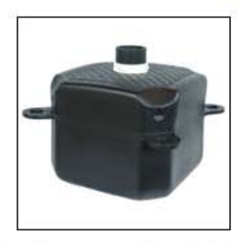
Tide Manager Stand-Alone System (#K011) A set of Machined cubes and tide manager poles, used to moor a Jet Dock where no existing structure exists.