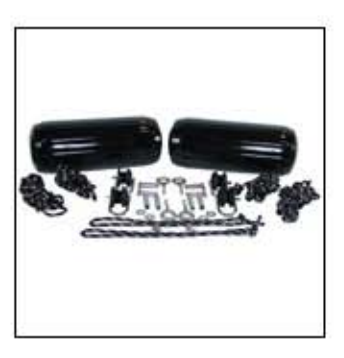
Deluxe Fender Mooring System (#A207) Used to moor a Jet Dock to An existing floating dock.