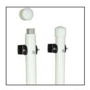
Tide Manager System (#A221) Used to moor a Jet Dock to an existing fixed structure.