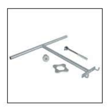
Jet Dock Tool Kit (#A331) Used for final assembly of larger docking systems.