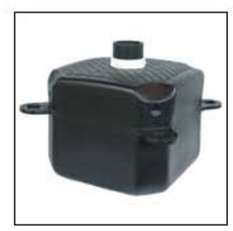
Tide Manager Stand-Alone System (#K011) A set of machined cubes and tide manager poles, used to moor a Jet Dock where no existing structure exists.