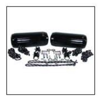
Deluxe Fender Mooring System (#A207) Used to moor a Jet Dock to an existing floating dock.