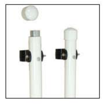
Tide Manager System (#A221) Used to moor a Jet Dock to an existing fixed structure.