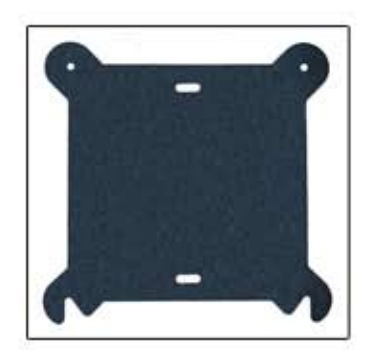
Open-Well Cover (#C797) Can be added to eliminate the openings in the dock.