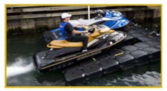
SEQUENTIAL FLEX TECHNOLOGY

The Jet Dock System and its assembly, designs and configurations depicted throughout this catalog are protected by U.S. Patents #5,529,013; #5,682,833; #5,931,113; #5,947,050; #6,431,106; #6,526,902 and #6,745,714; Canadian Patent #2,174,705; European Patent #0,837,815 and #1,440,003; and other pending U.S., Canadian, and International Patents. For more information on licensing and/or patent infringement clarification, please contact Jet Dock Systems, Inc.