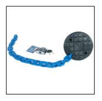
HD Security System (#A136) Used to lock a craft down to the Jet Dock. Also available built into a cube (#A135).